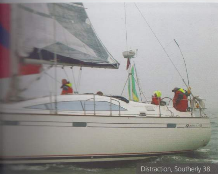
Distraction, Southernly 38