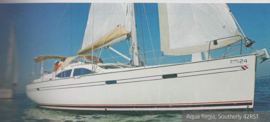
Aqua Regia, Southerly 42RST