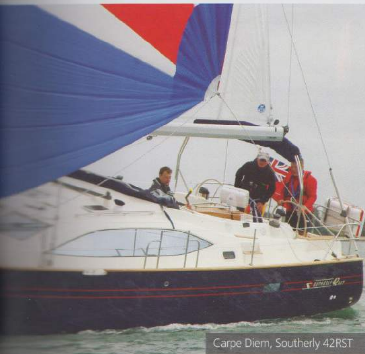
Carpe Diem, Southernly 42RST