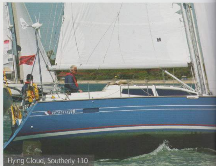
Flying Cloud, Southerly 110