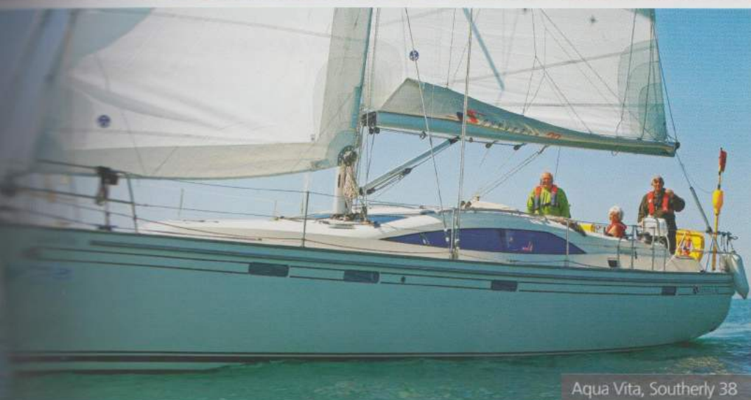
Aqua Vita, Southerly 38

Soon the wind filled in, as promised, and the fleet set off towards the Solent. As the day went on, the wind built to a steady 15 kts as the Southerly fleet powered in through the Hurst narrows into the Solent. A short beat to the finish saw many boats take advantage of the tide turning later on the Island shore. The fleet closed on the front runners, which made a remarkably close finish to the days' sailing.