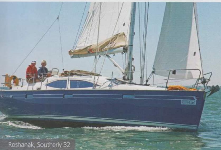
Roshanak, Southerly 32

Whilst everyone waited for the wind, the sun was out and all had plenty to watch as the race committee boat demonstrated man overboard manoeuvres in Poole Bay !