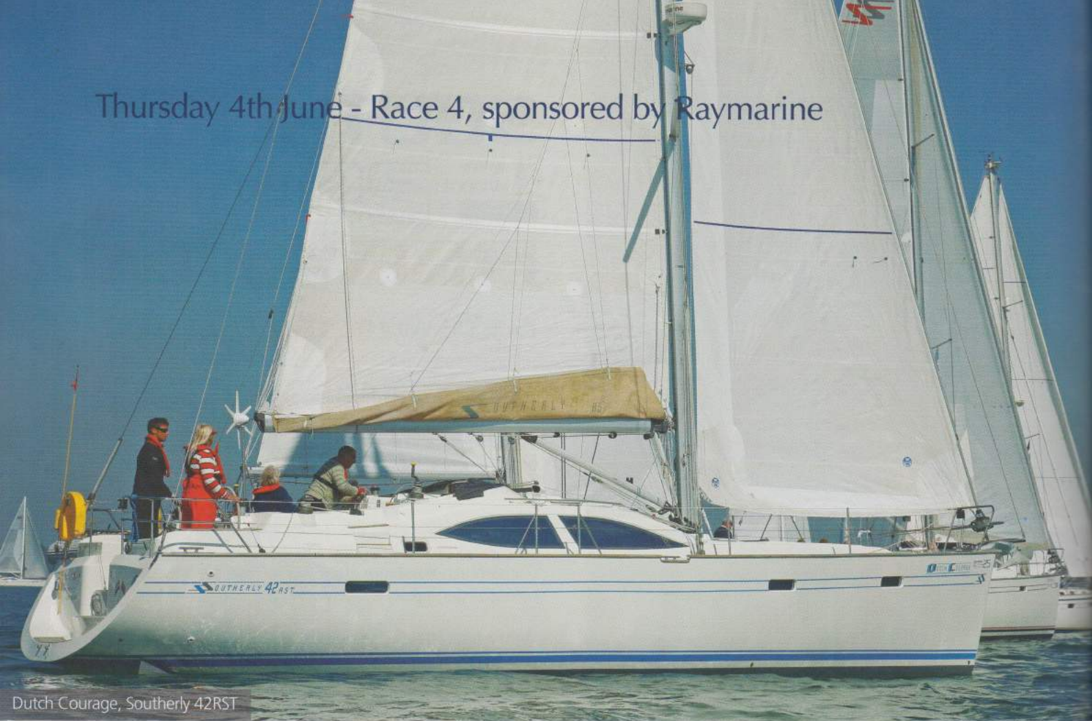
Dutch Courage, Southerly 42RST

Thursday 4th June - Race 4, sponsored by Raymarine