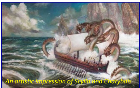
An artistic impression of Scylla and Charybdis

that he has to pass on between two high cliffs on his journey northward. In a cave in the mountain on the east side Scylla resides. She(?) is a monster with six heads, each of them with terrible teeth. No one can pass the monster without each of the six heads grabbing one of the