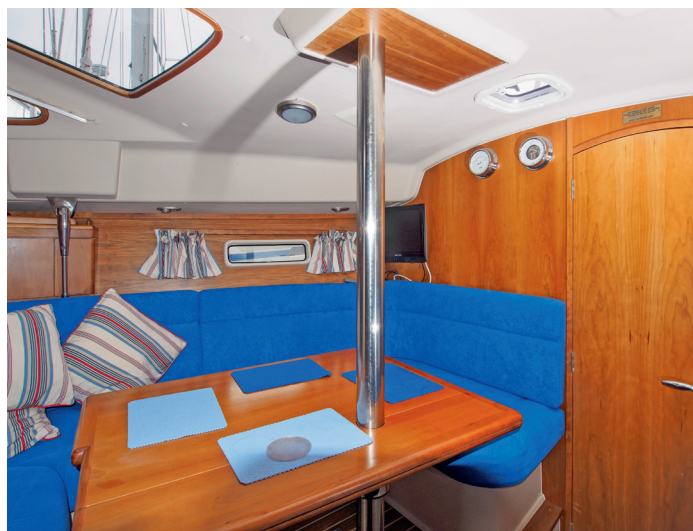
The saloon table and seating are generously sized, but access isn't great

Two more steps down lead you into the saloon, with its large, U-shaped seat to port and long, curved settee opposite. Although there's plenty of space here for dining, resting and entertaining for up to eight people, the keel box at the after end limits access around the table. This, together with the high galley bulkhead, makes it feel just a little cramped.