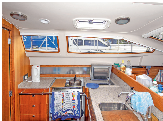
The galley is well laid out and big enough to cook for a crew of 10!