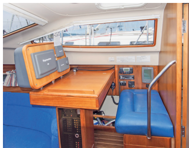
Having the chart table and seat raised up allows excellent forward vision